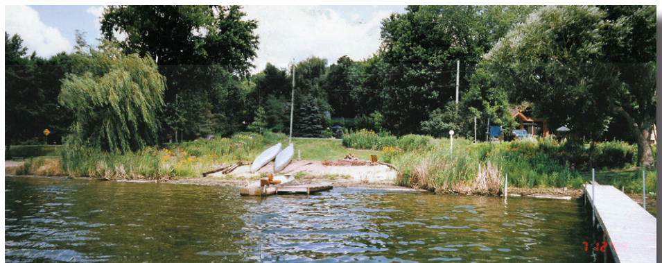
Beach blanket at shoreline.

Keep in mind that you are not allowed to install any plant barrier or liner (e.g., filter fabric or plastic) underneath your constructed beach. If owning lakeshore property with a sandy beach is a high priority for you, look for lakeshore property where sandy beaches occur naturally before you make that important purchase.