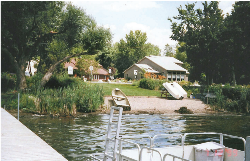
Another example of a beach blanket is pictured above.

©2012 State of Minnesota, Department of Natural Resources. Prepared by DNR Ecological and Water Resources. Based on Minnesota Statutes 103G, Public Waters Work Permit Program Rules Chapter 6115.